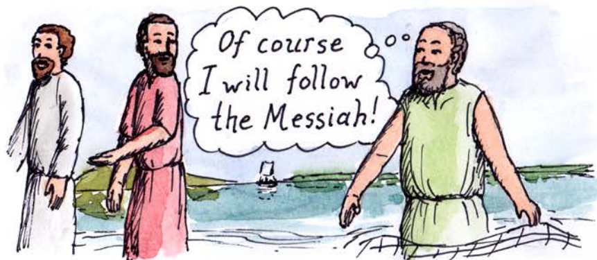
Answer to front page: We have found the Messiah! Answer to Cross-Word: his vocation.

God does not call all of us to very important jobs like the prophet Samuel and Saint Peter. But each of us should follow Jesus and be ready to do His will. If we always try to do what God wants, then we will be ready if He does have a special job for us! How can you do God's will today?