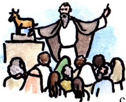
Joshua 24:1-2, 15-18

In today's first reading, Joshua told the people that they had to choose between the false gods and the true God. Joshua and the people chose to worship the true God.