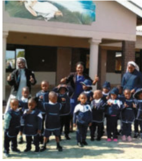
Pre-school children and teachers.

Around the corner is our Oct. 1 celebration on the Feast of St. Theresa of the Child Jesus. We are excited to hear