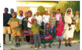
Children and house mothers together at the orphanage.

afford schools in Gweru and is located in a high-density suburb so mothers can go to work. Also, children living in the orphanage attend. A Sister trained and qualified to manage pre-school runs the school along with sisters who are retired from teaching in elementary schools. The Sisters also are finishing work on a