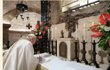
Pope Francis signing "Fratelli Tutti"