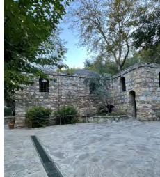
The House of the Virgin Mary located on Mt. Koresos in the vicinity of Ephesus, Turkey.

visited Mary's House during a recent pilgrimage that included Turkey. This place is where Mary eventually lived out her days after Jesus spoke of her from the Cross to John. Today it is one of the world's holiest shrines—visited by more than a million people a year. It is revered by both Christians and Muslims, and Pope Paul VI and Pope John Paul II both worshiped there, making special journeys to do so.