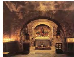
View of main altar. Daily visitors may not take photographs.