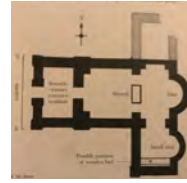
The floor plan. (book photo)