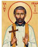
St. Francis Xavier Feast Day Dec. 3

"It is not the physical exertion that counts toward one's progress, nor the nature of the task, but by the spirit of faith with which it is undertaken."