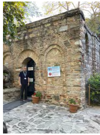
Father at the house's entrance.