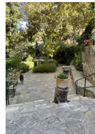
Above and top right: Path from the house to a spring fountain. Right: Father drawing water.