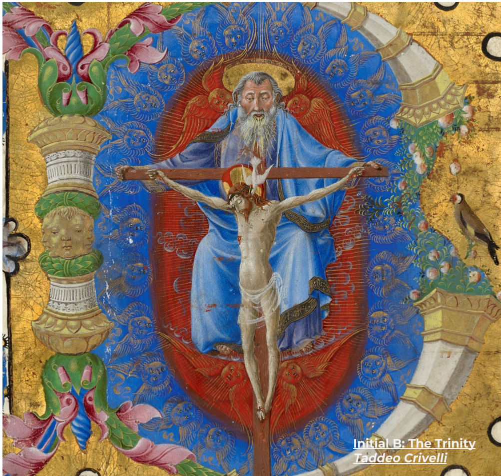
Initial B: The Trinity Taddeo Crivelli