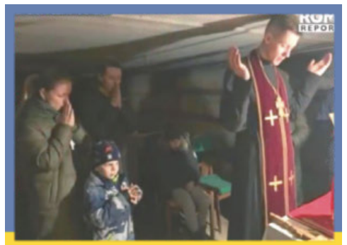
A priest says Mass in a subway car used as a bunker.

Report suspected child sexual abuse to local law enforcement and at 800-352-6513.