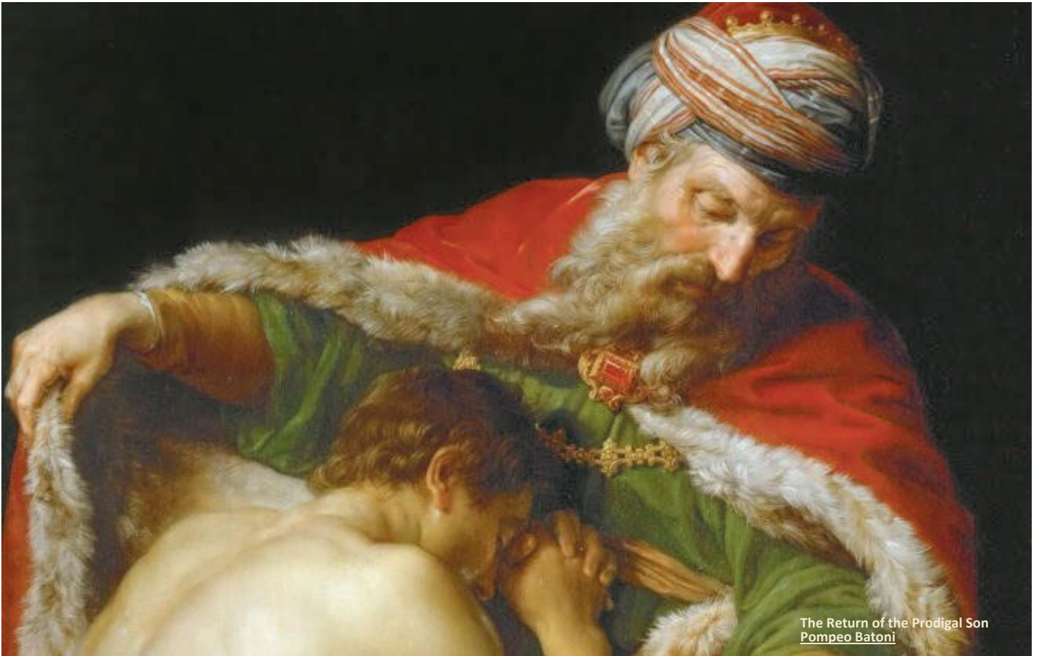
The Return of the Prodigal Son Pompeo Batoni