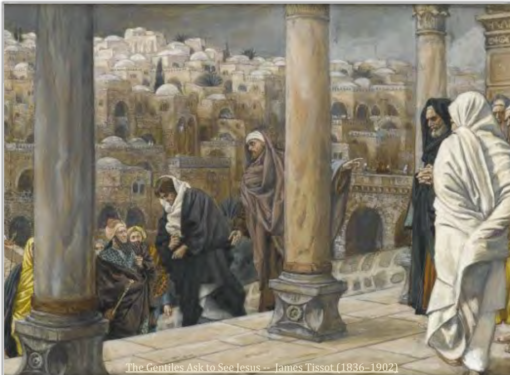
The Gentiles Ask to See Jesus -- James Tissot (1836-1902)

"The hour has come for the Son of Man to be glorified. Very truly, I tell you, unless a grain of wheat falls into the earth and dies, it remains just a single grain; but if it dies, it bears much fruit."