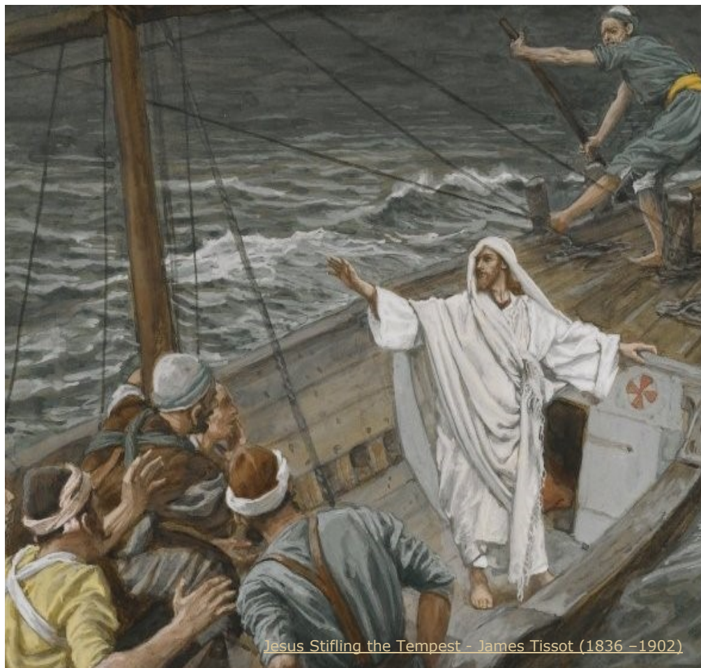
Jesus Stifling the Tempest - James Tissot (1836 -1902)

📍 912 Seventh St., Moundsville, W.VA. 26041 ☎ 304-845-1593 📧 sfxmoundsville@comcast.net