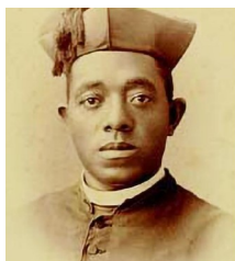
FEBRUARY BLACK HISTORY MONTH

is considered to be the first ordained African American Catholic priest. He escaped slavery with his mother and siblings during the Civil War. He mostly self educated and eventually attended seminary in Rome since no American seminary would accept him. He was a pastor in Chicago. More here at bit.ly/3u3Cu8E