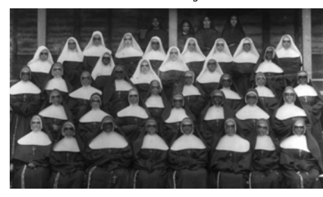
Sisters of Holy Family,

white in white congregations or establishing their own orders. Between 1824 and 1922, African American women organized at least eight historically black and Afro-Creole orders, of which three are still in existence: The