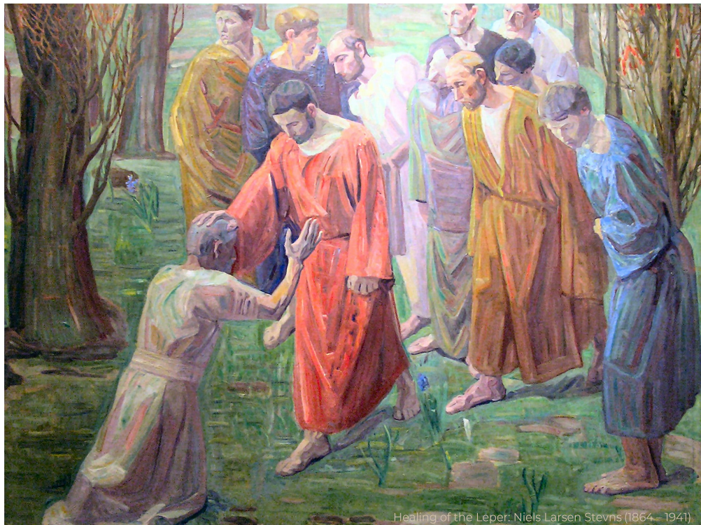
Healing of the Leper: Niels Larsen Stevns (1864 – 1941)

📍 912 Seventh St., Moundsville, W.VA. 26041 📞 304-845-1593 📧 sfxmoundsville@comcast.net