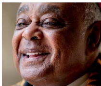
FEBRUARY BLACK HISTORY MONTH

WILTON GREGORY , archbishop of Washington, D.C., recently was named by Pope Francis as America's first black cardinal. Gregory grew up in Chicago, where he decided in grammar school to become a priest without yet being Catholic. Gregory was ordained into the priesthood when he was 25.