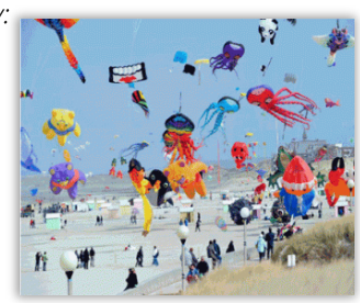
Legend says Kite Fest comes from a Bermudan teacher's creative effort to illustrate the Ascension of the Lord.

Festivities begin with a <u>Good Friday Kite Fest</u> where celebrants fly homemade kites. Folks also eat codfish and traditional hot-cross buns, and on Easter Sunday attend sunrise services on beaches across the island.