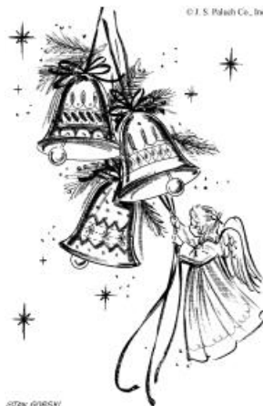
The Little Ones