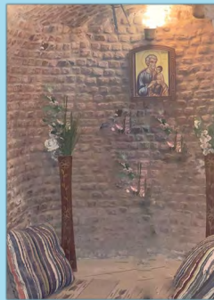
(Dru Meyer photo: pilgrimage trip)

THIS MODEST space is part of the cavern in Egypt where the Holy Family lived for three months while fleeing from Herod. A church was built over the cavern in the 4th Century by the Coptics to honor the Holy Family's time among them. We hope this view brings inspiration.