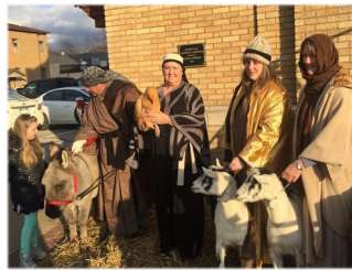
Christmastime visit 2019.

Again this year those coming to Children's Mass on Christmas