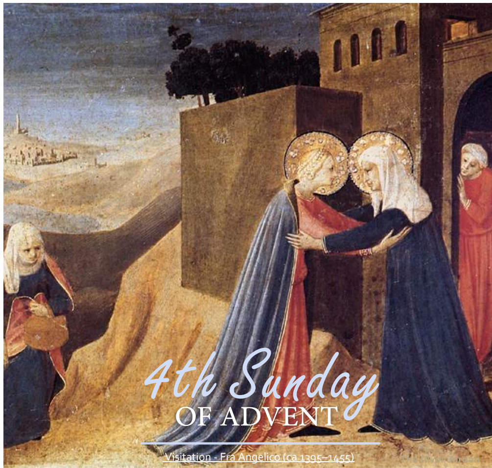
Visitation - Fra Angelico (ca 1395-1455)

912 Seventh St., Moundsville, W.VA. 26041 304-845-1593 sfxmoundsville@comcast.net