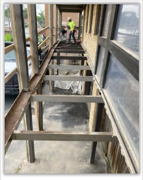
WATCH YOUR STEP! The work is almost finished. Thank you for your patience.

REMINDER: PARISHIONERS ONLY MAY ENTER THE OFFICE VIA THE RECTORY MONDAYS AND TUESDAYS DURING RAMP WORK.