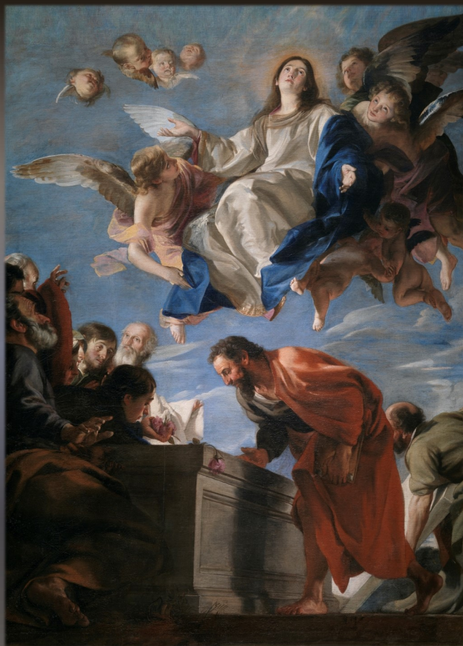
The Assumption of the Virgin CABEZALERO, JUAN MARTÍN