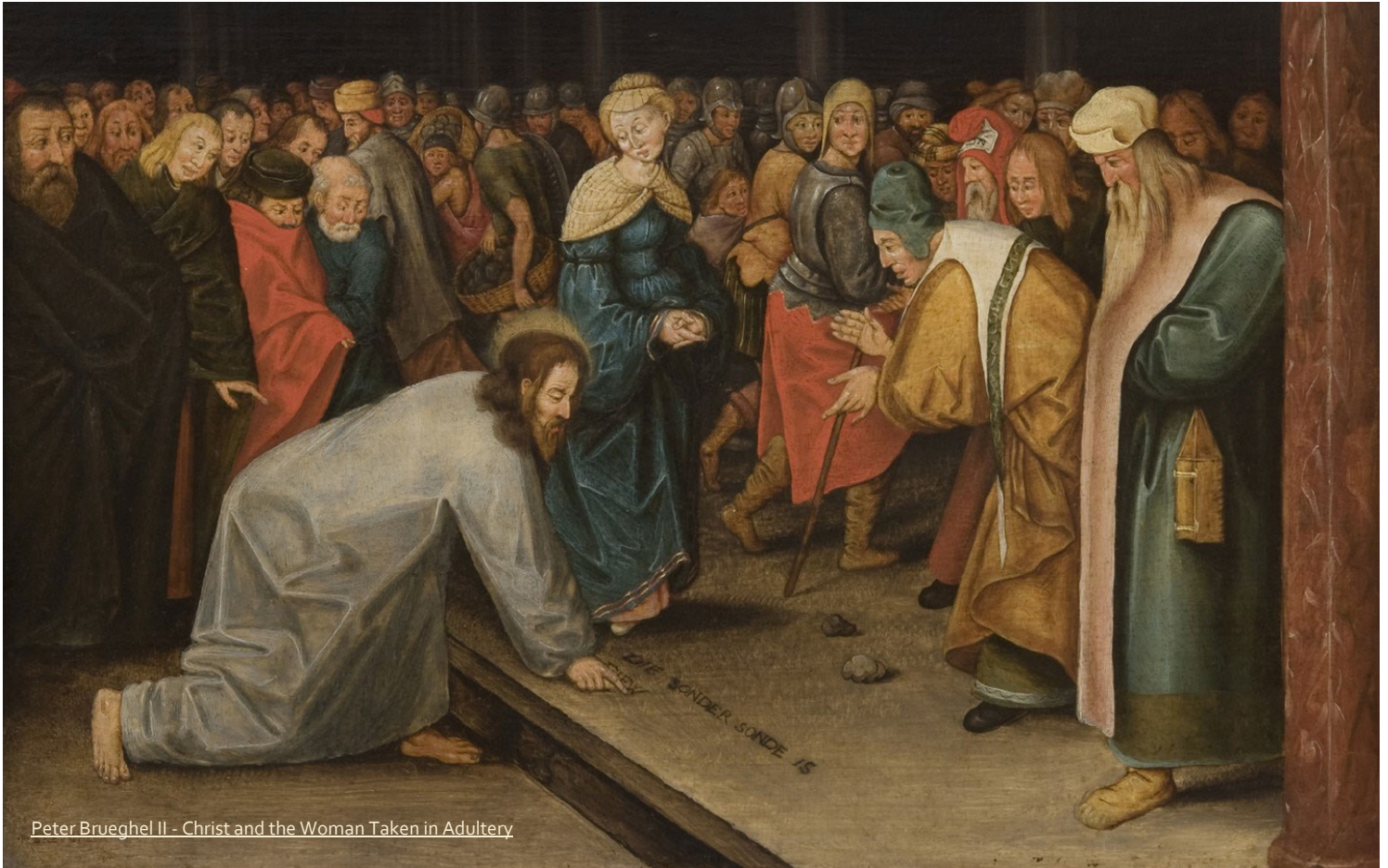
Peter Brueghel II - Christ and the Woman Taken in Adultery