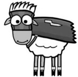
Sheep with Jesus