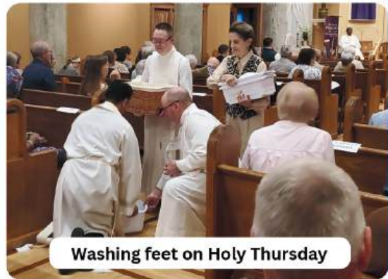
Washing feet on Holy Thursday

God bless our parish family this Easter season.