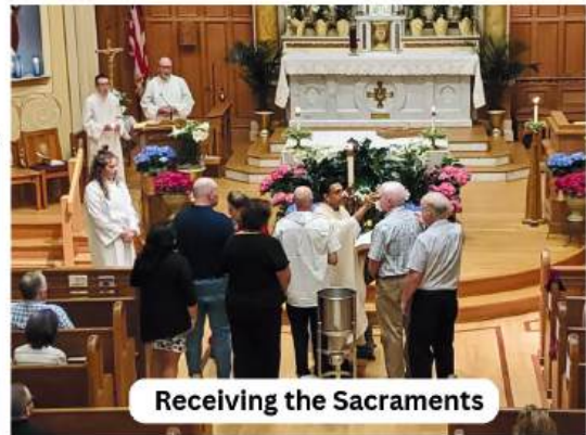
Receiving the Sacraments