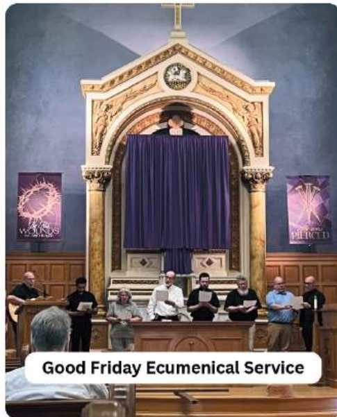
Good Friday Ecumenical Service