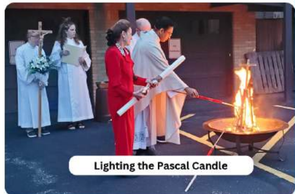
Lighting the Pascal Candle